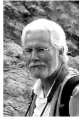
Sigurd von Boletzky