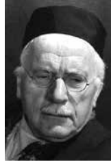
Carl G. Jung