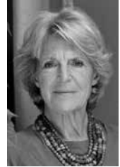
HRH Princess Irene of the Netherlands